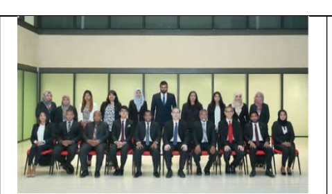
Ease of Doing Business in Maldives: Dispute Resolution Mechanisms (13 – 16 Feb 2017)

The SJC conducts the judicial training programmes both within and outside of Singapore. The courses held outside of Singapore in the host country are invariably customised to meet the identified needs of that jurisdiction. In 2017, the International Wing of the SJC offered the following workshops: (i) "Ease of Doing Business: Dispute Resolution Mechanisms"; (ii) e-Filing Workshop for Fiji Judiciary; (iii) Judicial Educators' Workshop; (iv) Strategies of Case Management; (v) Judgment Writing & Oral Judgment Workshop; (vi) End-To-End Court Technology; (vii) Managing Conflicts & Resolving Disputes Effectively through Mediation Workshop; (viii) Assessing Credibility of Witnesses Workshop; (ix) Leadership in Court Governance; and (x) Judiciary-Wide Induction Programme, just to name a few.